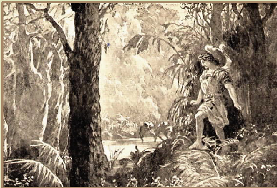
Satan's entrance to Eden

“Thou wast perfect in thy ways from the day that thou wast created, till iniquity was found in thee.” (Ezekiel 28:15)